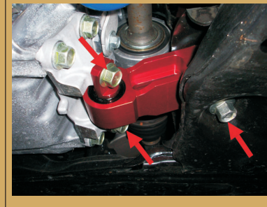
Insert the top mount. Line up and insert the rear bolt.